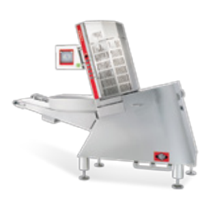
DIVIDER ORBITAL+ SLICES SHABU SHABU