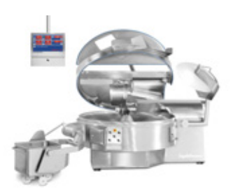
K120 BOWL CUTTER